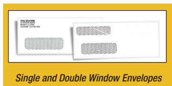
Single and Double Window Envelopes

Note: MICR toner cartridge and special fonts are required to print checks using the Stock Laser Check product. Financial institutions will not process negotiable documents without the use of these features.